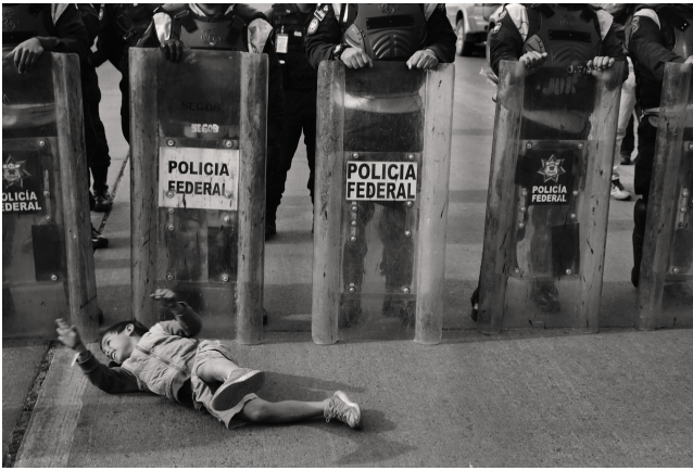
5. Young Migrant, Tijuana 2018 Silver gelatin print 12" x 18" Edition of 15 1500.00