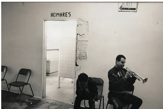
28. Mariachis Del Carcel, Mexico 1996 Silver gelatin print 12" x 18" Edition of 15 1500.00