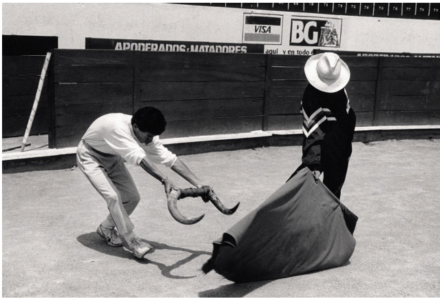
9. Matador Training, Quito, Ecuador 1990 Silver gelatin print 12" x 18" Edition of 15 1800.00