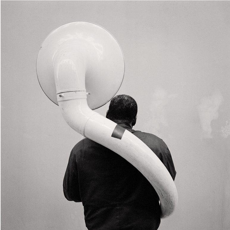
11. New Orleans, 1989 Silver gelatin print 18" x 18" Edition of 15 2000.00