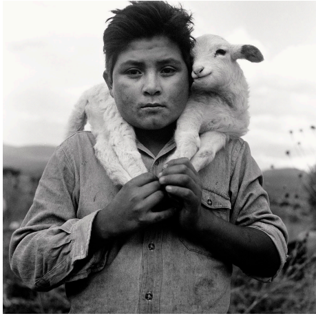
26. Young Shepherd, Mexico 2010 Silver gelatin print 14" x 14" Edition of 15 1500.00