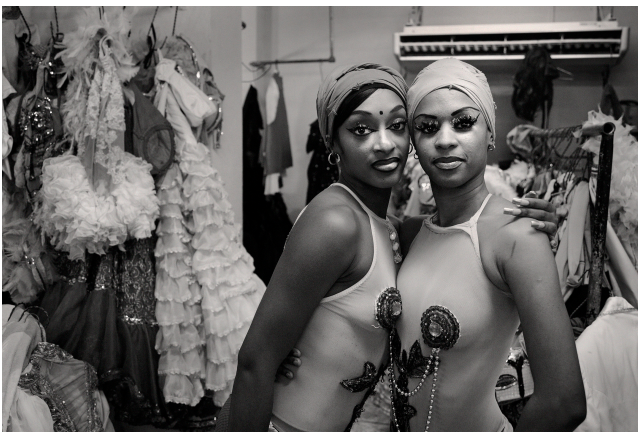
8. Backstage at the Tropicana, Havana 2010 Silver gelatin print 12" x 18" Edition of 15 1500.00