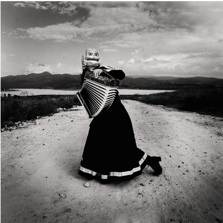
12. La Mueca Patzcuaro, 1995 Silver gelatin print 18" x 18" Edition of 15 2000.00