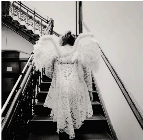
14. Chelsea Hotel, New York 1993 Silver gelatin print 15" x 15" Edition of 15 1500.00