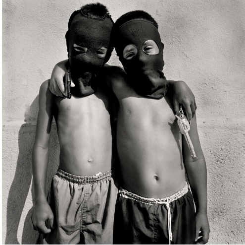
13. Hermanos, Havana 2012 Silver gelatin print 17" x 11" Edition of 15 1500.00