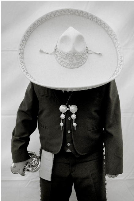
27. Mariachi Joven, Guadalajara 2002 Silver gelatin print 18" x 12" Edition of 15 1800.00