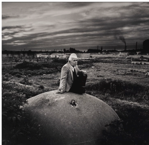
15. Bomb Shelter, Albania 1989 Silver gelatin vintage print 14.75" x 14.75" Edition of 15 1800.00