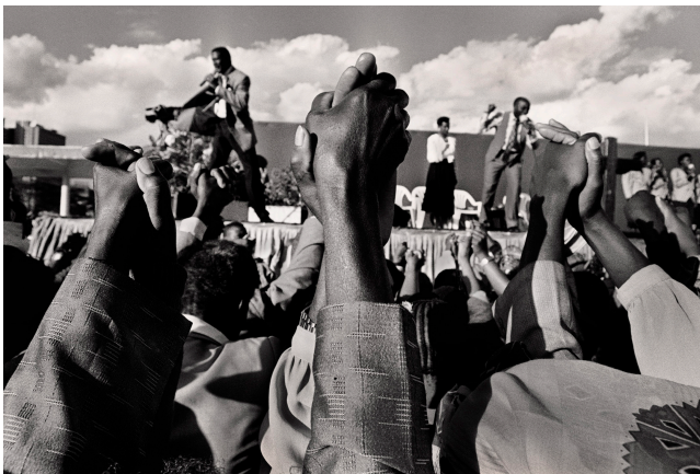
10. Revivalist Meeting, Nairobi 1988 Silver gelatin print 12" x 18" Edition of 15 1500.00