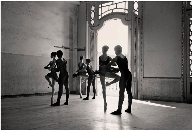
6. Ballet Practice, Havana 2010 Silver gelatin print 12" x 18" Edition of 15 1500.00